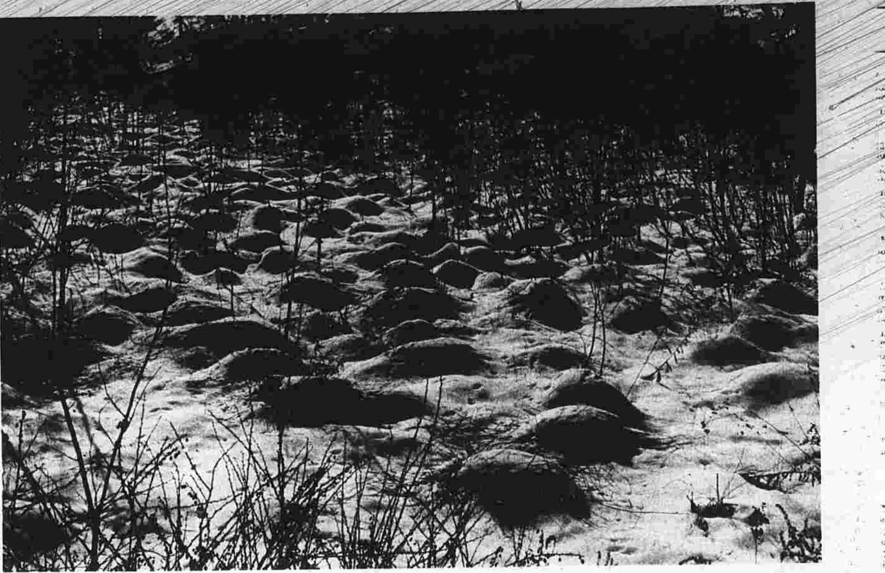
THE BOG IN WINTER.

OAO - U.S. and Russian. The mystery and the wonder of Christmas is expressed very beautifully in the words "We know God now in a visible way." God, the unknowable, God who said to Moses, "My face you cannot see, for no man sees me and lives" has come among us clothed in human flesh and pitched his tent among us.