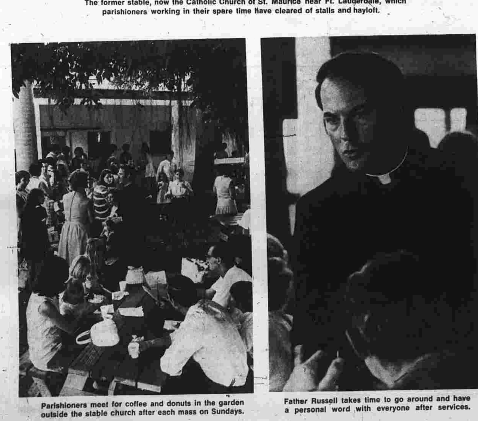
Parishioners meet for coffee and donuts in the garden outside the stable church after each mass on Sundays.