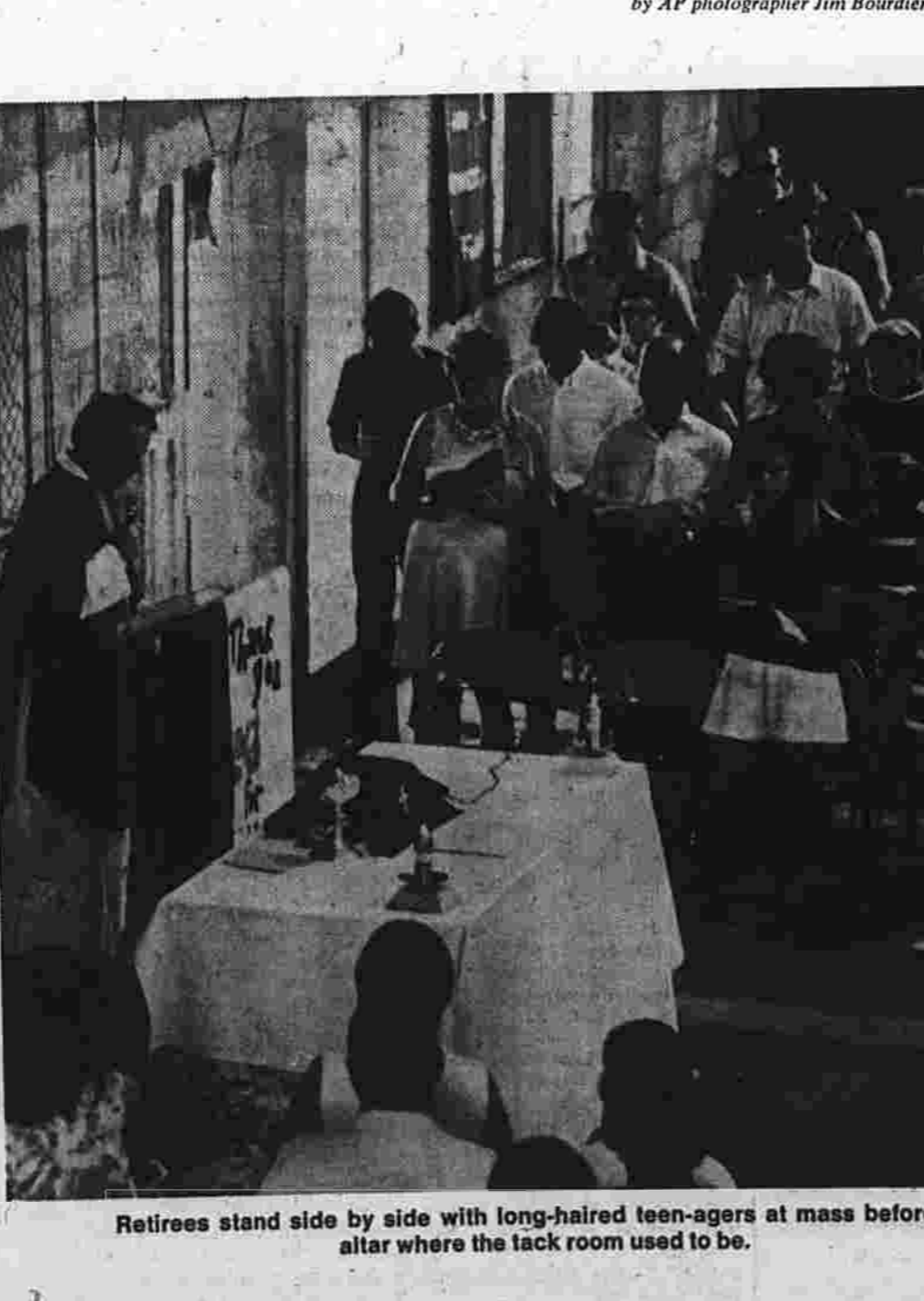
Retirees stand side by side with long-haired teen-agers at mass before an altar where the tack room used to be.