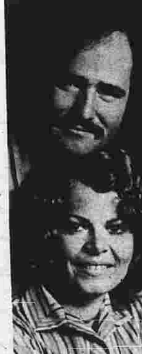
Rob Reiner and Sally Struthers team up for new comedy show, "All in the Family," beginning Jan. 12 on Channel 3.