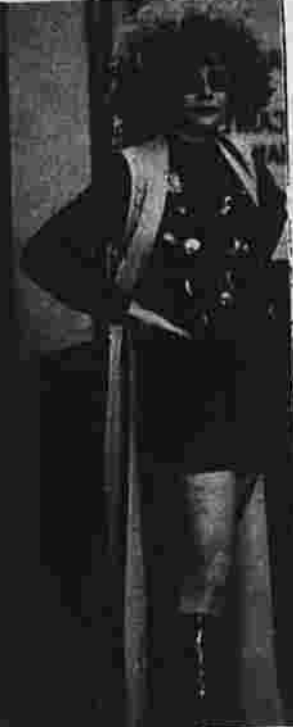
Lucy goes to extremes to get fired on "Here's Lucy Show" Monday on CBS as Lucille Ball begins new year.