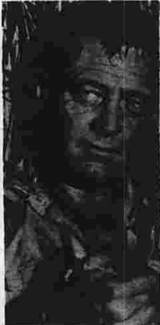
William Holden stars in movie, "Bridge on the River Kwai" Jan. 7.