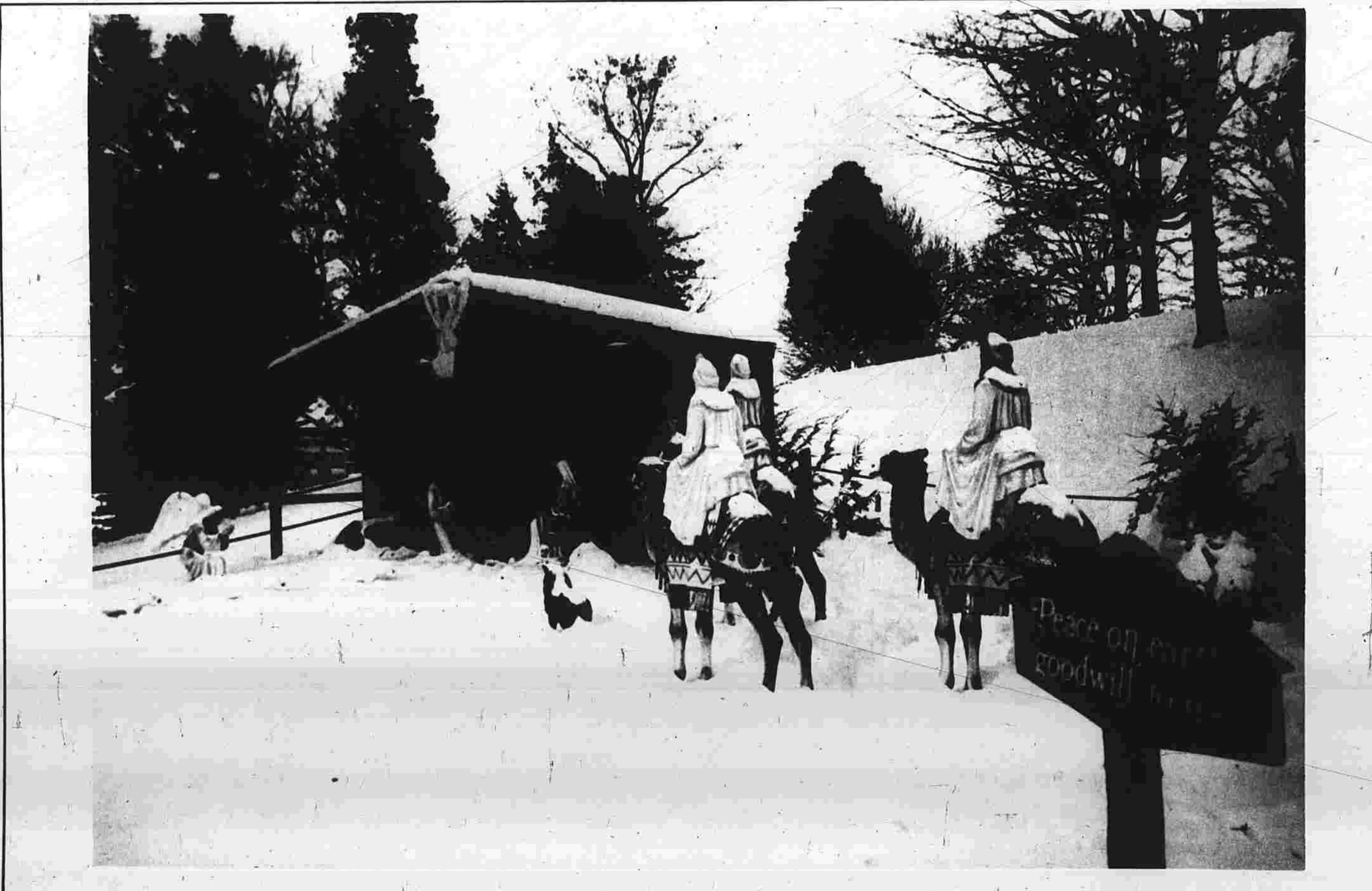
Manchester Nativity Scene