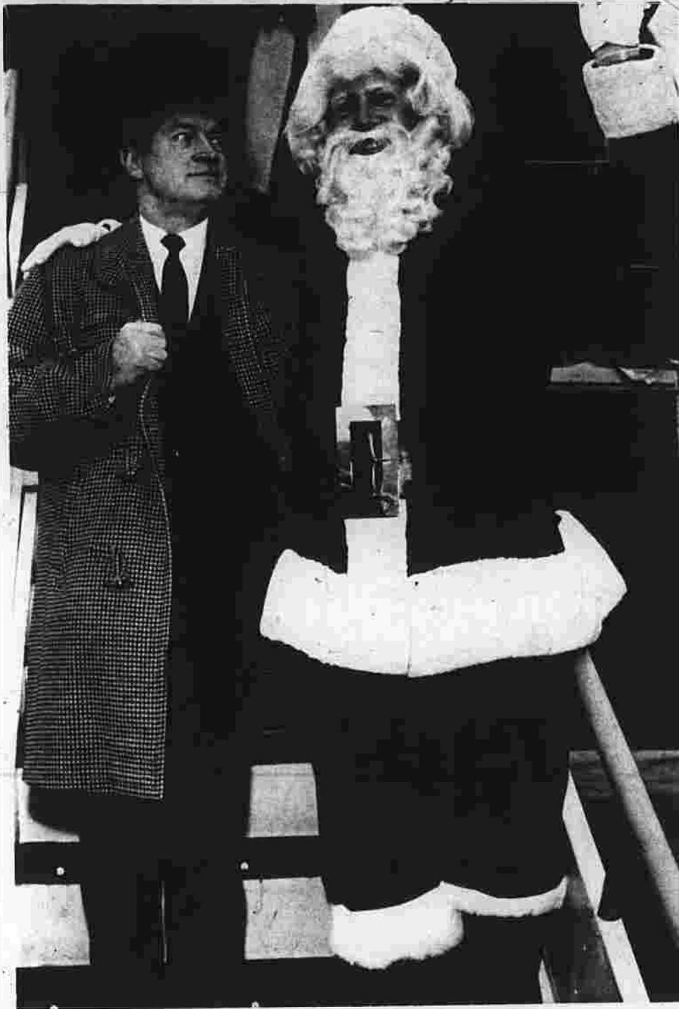
Santa Claus's companion is faithful Bob Hope as the joyful duo arrives in Vietnam for their annual visit. Bob's show will be on NBC Jan. 14.