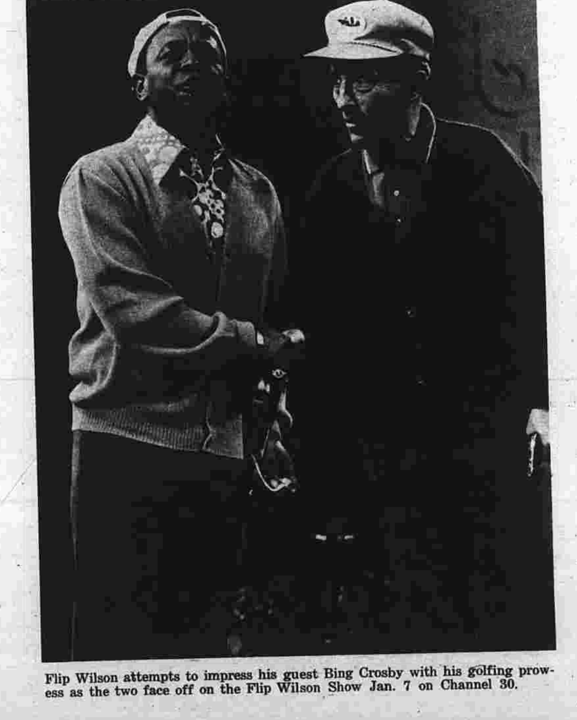
Flip Wilson attempts to impress his guest Bing Crosby with his golfing prowess as the two face off on the Flip Wilson Show Jan. 7 on Channel 30.

daddy (C) 3:00 (3) Governor and J.J. (C) 3:30 (3) Movie (C) "11 We Meet Again" (C) 9:00 (3) Medical Center E (C) (8-40) Johnny Cash Show (C) Guests include Tennessee Ernie Ford and Louis Armstrong. (C) 9:30 (8-40) Weather - Sports and News (C) 10:00 (3) Hawaii Five-O (C) 10:30 (3) Das Boot (C) 10:30 (3) Four-in-One (C) 10:30 (18) Heartford Talk-In (C) 11:00 (8-12-40) News - Weather and Sports (C) 11:25 (3) Movie (C) "Destiny" '57. Story of young boy brought to western town to help avert clean town up. Audie Murphy, Mari Blanchard. (C) 11:30 (30) Tonight Show Johnny Carson (C) (8-40) Dick Cavett Show (C) 1:00 (3-30-40) News - Prayer and Sign Off (C) 1:15 (3) News and Weather - Prayer and Sign Off (C)