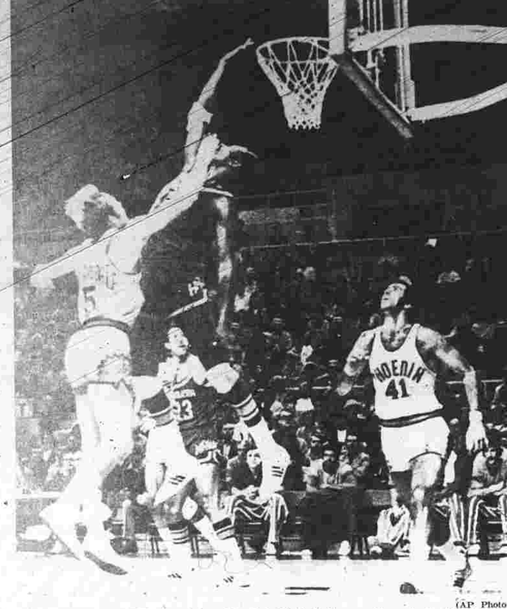
BLUING EFFORT—Atlanta Hawks' Walt Bellamy attempts to block a shot by Phoenix's Dick Van Arsdale during NBA action. Neal Walk watches.